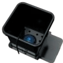
AirBase Square fits AutoPot 8.5L and 15L plastic pots as used in 1Pot modules (pictured) and easy2grow modules

DESIGNED FOR EASY OPTIONAL INTEGRATION WITH AIRDOME