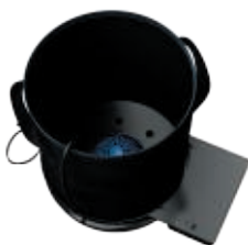
AirBase Round fits AutoPot 25L plastic and 20L fabric pots as used in XL and XL FlexiPot modules